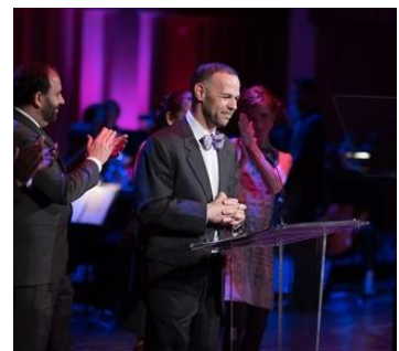
Bancroft Elementary School 2016 Award Winner for Excellence by an Academic Leadership Team