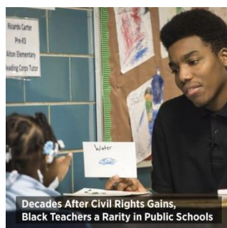
Decades After Civil Rights Gains, Black Teachers a Rarity in Public Schools