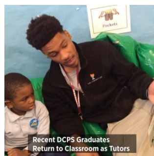
Recent DCPS Graduates Return to Classroom as Tutors