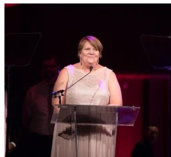
Truesdell Education Campus 2016 Award Winner for Excellence in School Innovation