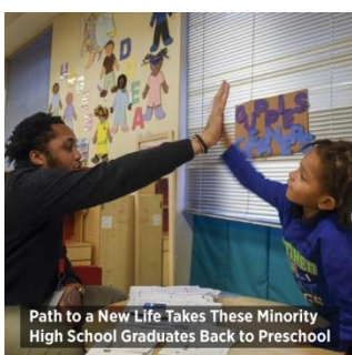
Path to a New Life Takes These Minority High School Graduates Back to Preschool

In the News: Click on the images below for featured articles on the Leading Men Fellows