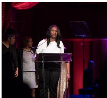
Stanton Elementary 2016 Award Winner for Excellence in Family Engagement